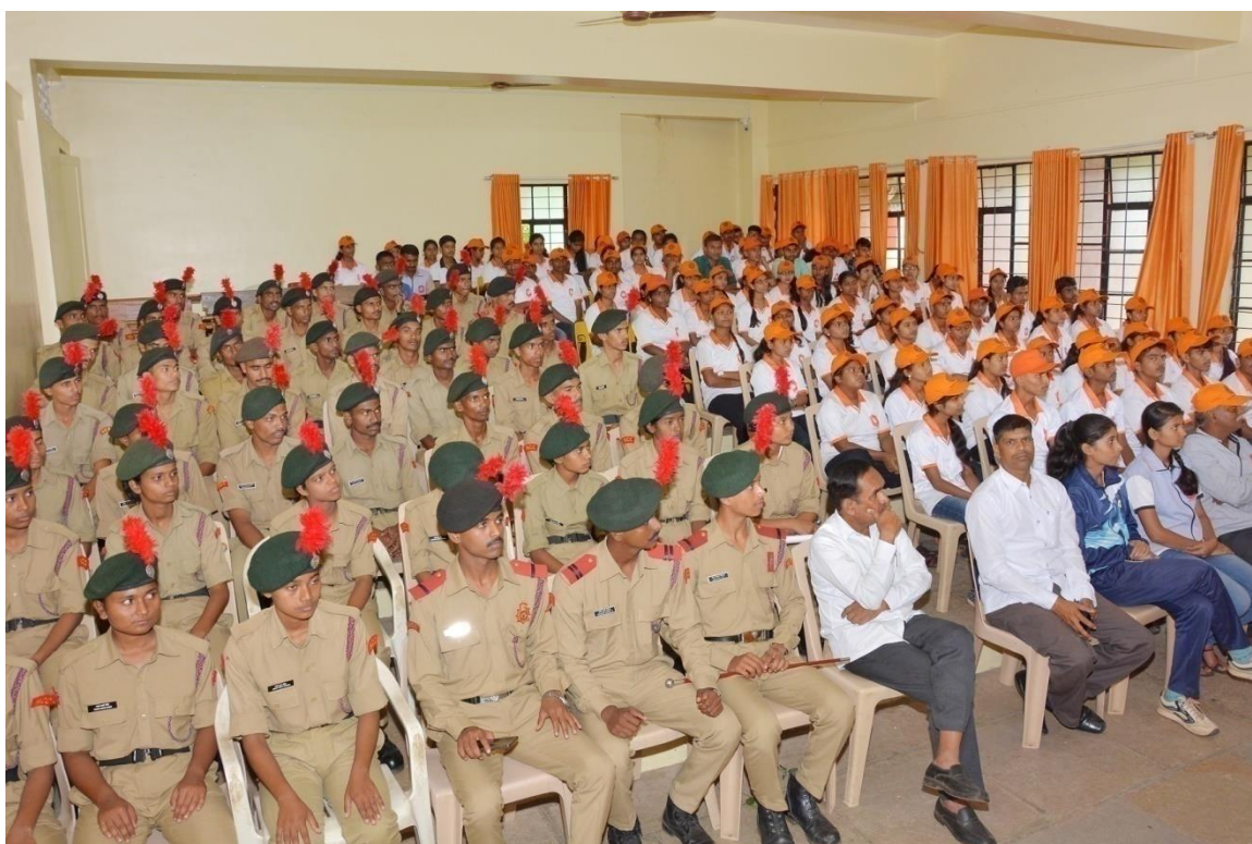
A Guest Lecture on 'Anti Ragging'