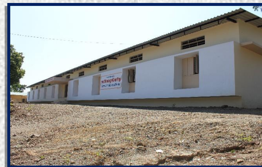
JAI KISAN BOY'S HOSTEL